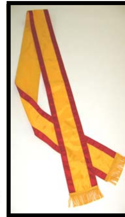
Sewn and Appliquéd Nylon Sash with 2" Gold Fringe and Three Stripe Offset Structure